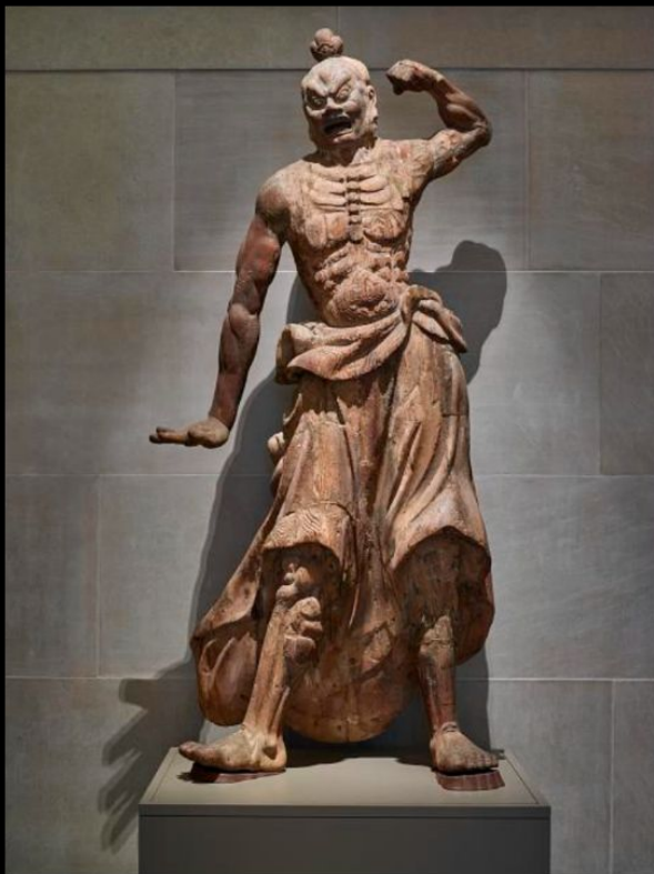
National Museum of Asian Art, Smithsonian Institution, Freer Collection, Purchase—Charles Lang Freer Endowment, F1949.21