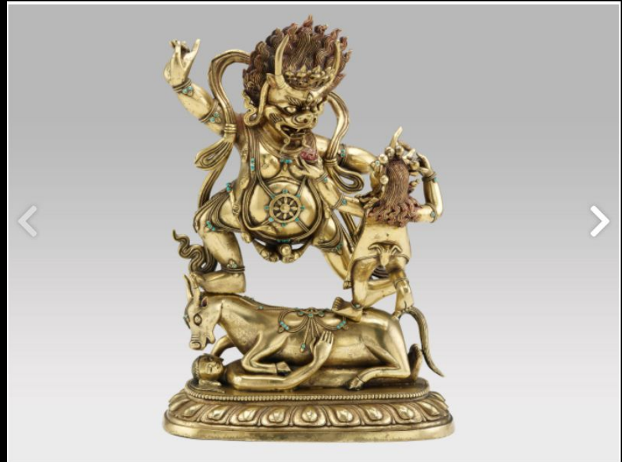
Dharmapala Yamaraja and Chamunda, China, Qing dynasty, mid-18th century, Gilt copper with turquoise insets and pigment, 36 × 25.5 × 13 cm (14 3/16 × 10 1/16 × 5 1/8 in), The Alice S. Kandell Collection, Arthur M. Sackler Gallery S2013.23a-e