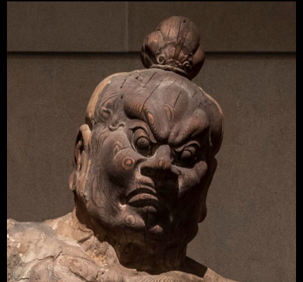
Bottom: National Museum of Asian Art, Smithsonian Institution, Freer Collection, Purchase—Charles Lang Freer Endowment, F1949.20