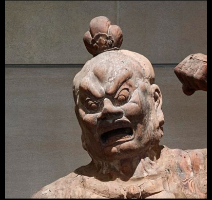
Top: National Museum of Asian Art, Smithsonian Institution, Freer Collection, Purchase—Charles Lang Freer Endowment, F1949.21