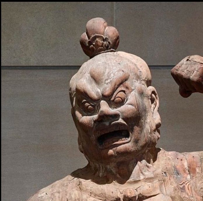
National Museum of Asian Art, Smithsonian Institution, Freer Collection, Purchase—Charles Lang Freer Endowment, F1949.21