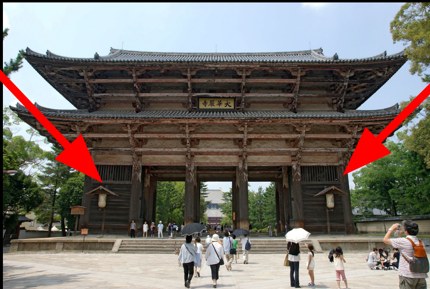
The Great South Gate at Tōdaiji Temple (Nara, Japan)

The guardians glower at visitors as they enter, towering as high as the temple's doorframe.