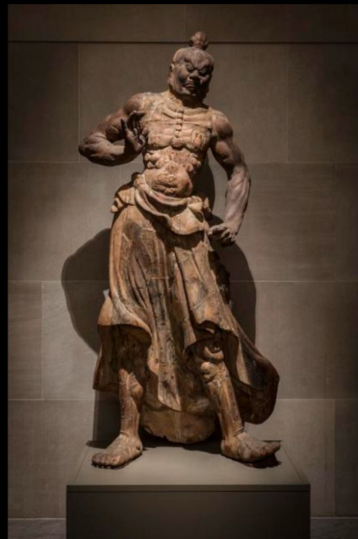
National Museum of Asian Art, Smithsonian Institution, Freer Collection, Purchase—Charles Lang Freer Endowment, F1949.20