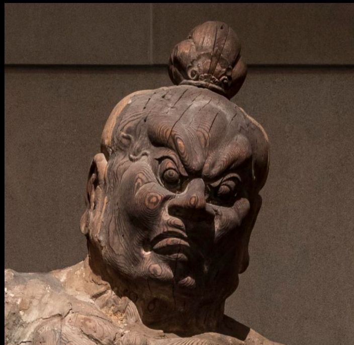
National Museum of Asian Art, Smithsonian Institution, Freer Collection, Purchase—Charles Lang Freer Endowment, F1949.20