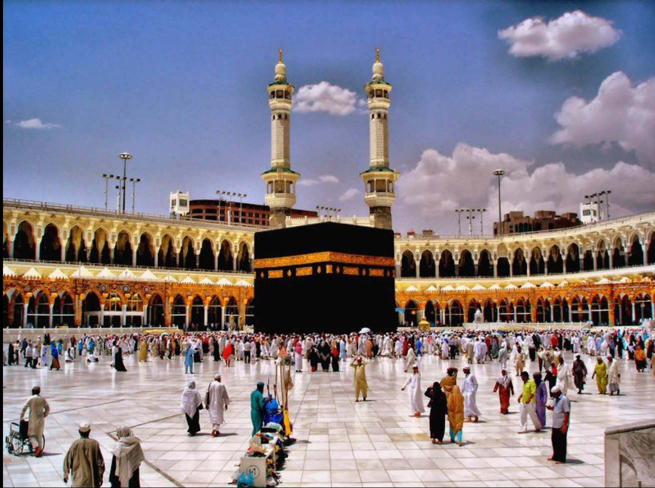
Photo centered on the Kaaba in Mecca