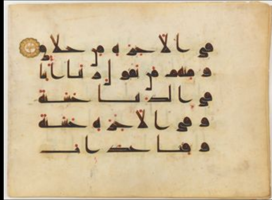
National Museum of Asian Art, Smithsonian Institution, Freer Collection, Purchase—Charles Lang Freer Endowment, F1937.6.1-33