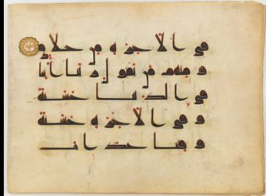
National Museum of Asian Art, Smithsonian Institution, Freer Collection, Purchase—Charles Lang Freer Endowment, F1937.6.1-33