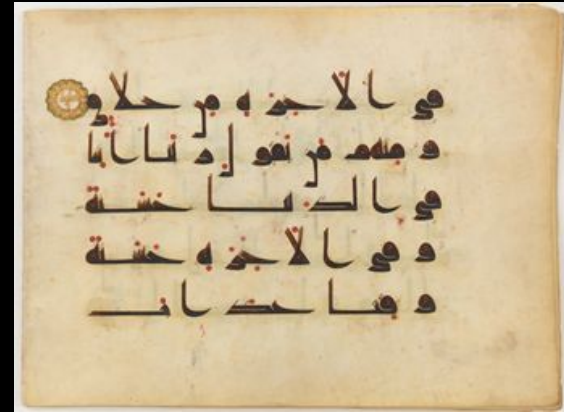
Fragment of a Qur'an, sura 2:191-233 Near East, 9th-10th century Ink, color, and gold on parchment Purchase-Charles Lang Freer Endowment National Museum of Asian Art, Smithsonian Institution, Freer Collection, F1937.6.1-33