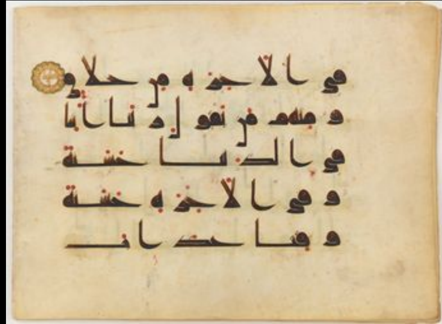
National Museum of Asian Art, Smithsonian Institution, Freer Collection, Purchase—Charles Lang Freer Endowment, F1937.6.1-33