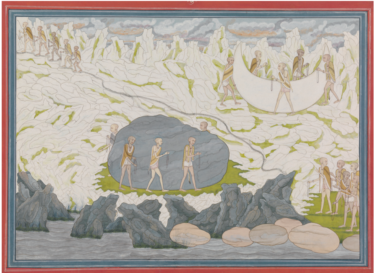
15d Five Sages in Barren Icy Heights