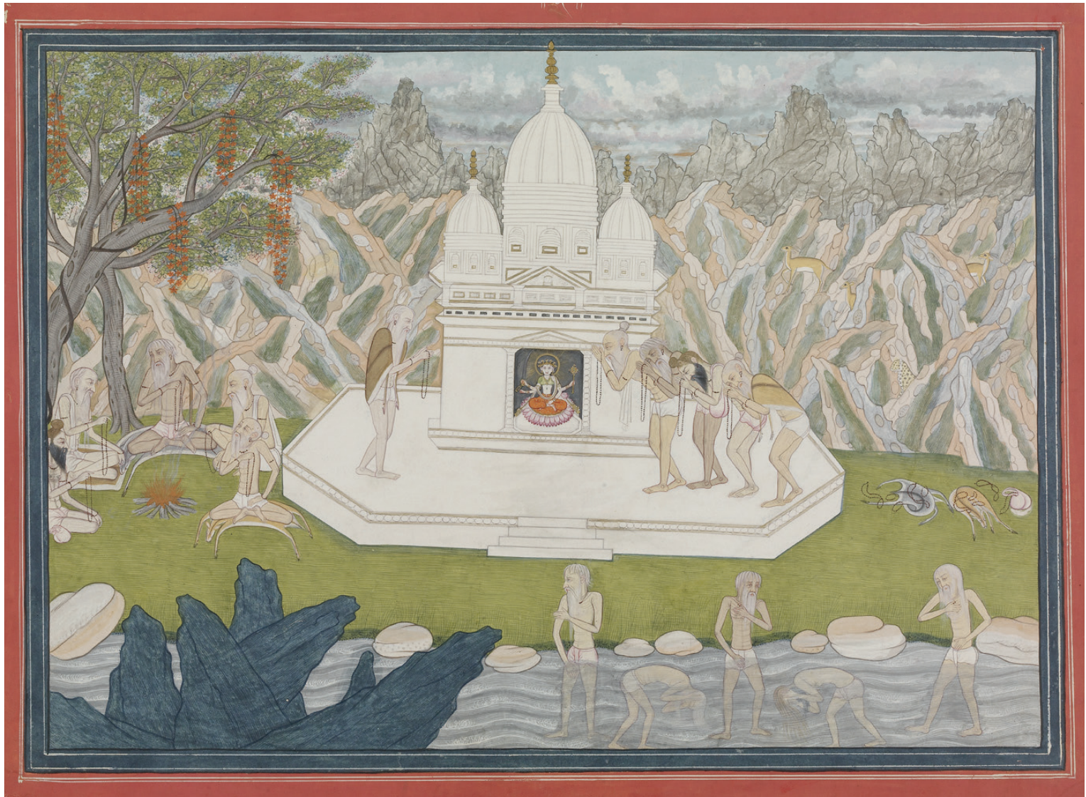
15b Ascetics before the Shrine of the Goddess

as if hinting at the dangers that lie in the pilgrims' path.