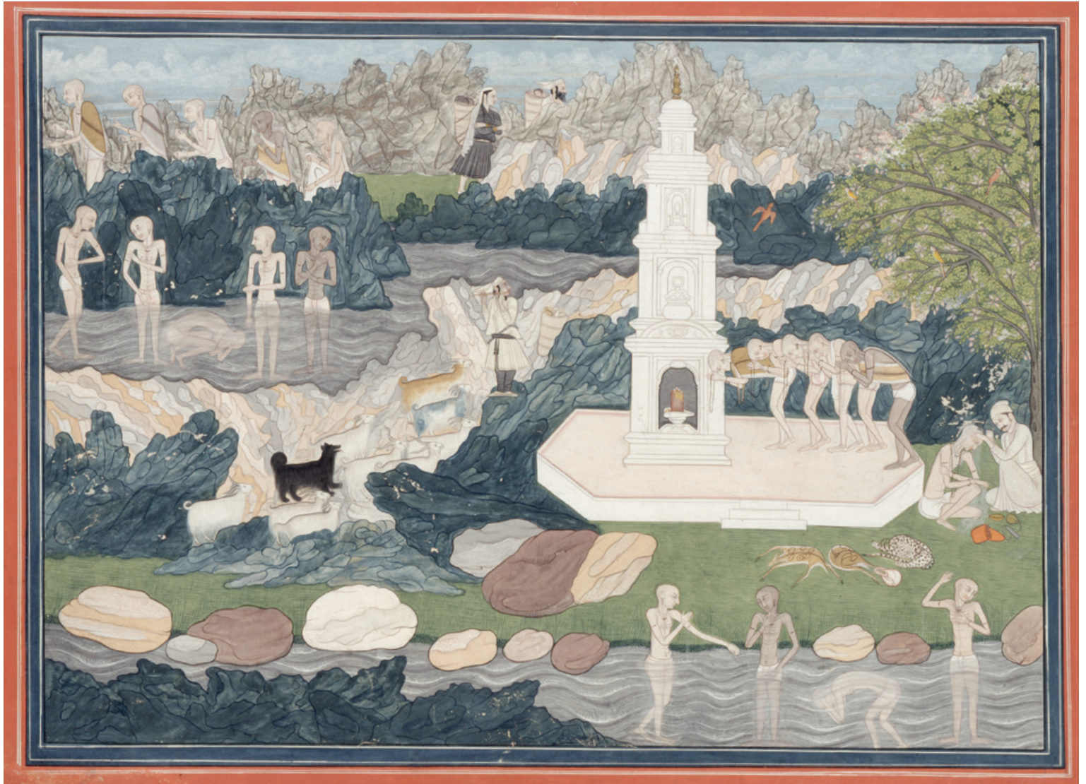
15a Himalayan Pilgrimage of the Five Siddhas