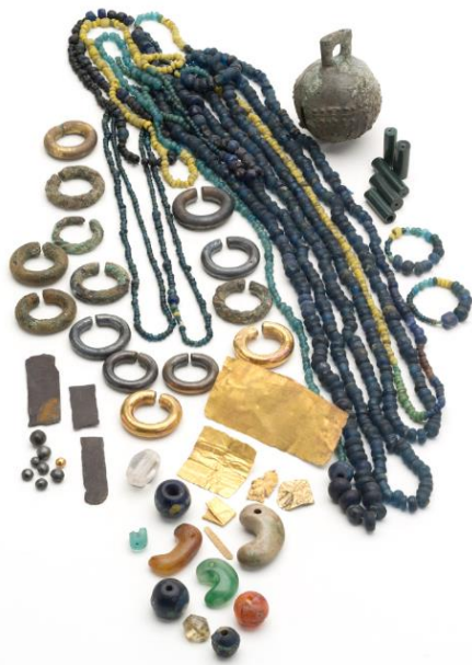
Figure 4. Precious objects unearthed from the wooden pagoda remains of Asukadera. After Nara bunkazai kenkyūjo Asuka shiryōkan, Asukadera 2013 (Osaka: Nara bunkazai kenkyūjo Asuka shiryōkan, 2013), 2.

Conversely, the platforms of the eastern and western halls were faced with natural stones placed in a more random fashion. Interestingly, small foundation stones were placed above the lower tier of the platform for the eastern and western halls. Among the Baekje Buddhist temple sites, the use of cut stone platforms can be found at the main hall and the wooden pagoda at the Neungsan-ri temple site. Two-tiered platforms with small foundation stones placed on the lower tier, however, can be found among the remains of the main hall at Jeongnimsa and the temple site at Gunsu-ri 軍守里.