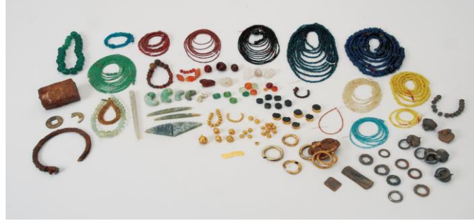
Figure 3. Various jewelries and ornaments excavated from the Wangheungsa temple site. After Gungnip Buyeo munhwajae yeonguso, Baekje Wangheungsa: Jeongyu nyeon e Changwang eul dasi mannada (Seoul: Gungnip Buyeo munhwajae yeonguso, 2017), 82–83.

The fifteenth day of the second lunar month marks the day when Shakyamuni, the Historical Buddha, attained the final enlightenment ( parinirvana ). Two sarira turning into three symbolizes their miraculous ability to multiply and suggests the sarira enshrined under the wooden pagoda of Wangheungsa represent the Buddha's true body. 4 More than eight thousand pieces of jewelry and other ornaments discovered around the foundation stone were ritual offerings made by nobles who participated in the ceremony of relic enshrinement (Figure 3). The material and composition of these artifacts are very similar to those unearthed from the tomb of King Muryeong 武寧 (reigned 501–23) in Gongju and the ancient tombs at Neungsan-ri in Buyeo.