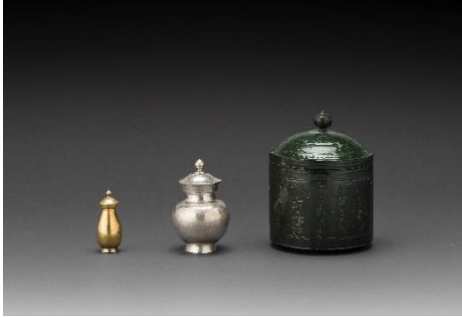
Figure 2. Gold, silver and bronze sarira reliquaries excavated from the wooden pagoda remains at the Wangheungsa temple site. After Gungnip Buyeo munhwajae yeonguso, Baekje Wangheungsa (Seoul: Gungnip Buyeo munhwajae yeonguso, 2017), 75.