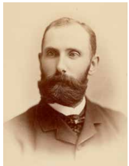
Charles Lang Freer, ca. 1880

Charles Lang Freer (1854–1919) , founder of the Freer Gallery of Art, was a Detroit businessman who began collecting American art in the 1880s. On his first trip to London in 1890, he met the American painter James McNeill Whistler, and they became lifelong friends. Whistler's work was strongly influenced by Japanese prints and Chinese ceramics, and he encouraged Freer not only to expand his collections to include Asian art but also to travel to Asia. Freer took his advice, making four extended trips throughout Asia and amassing a now-famous collection of American and Asian art, including the world's most extensive collection of works by Whistler.