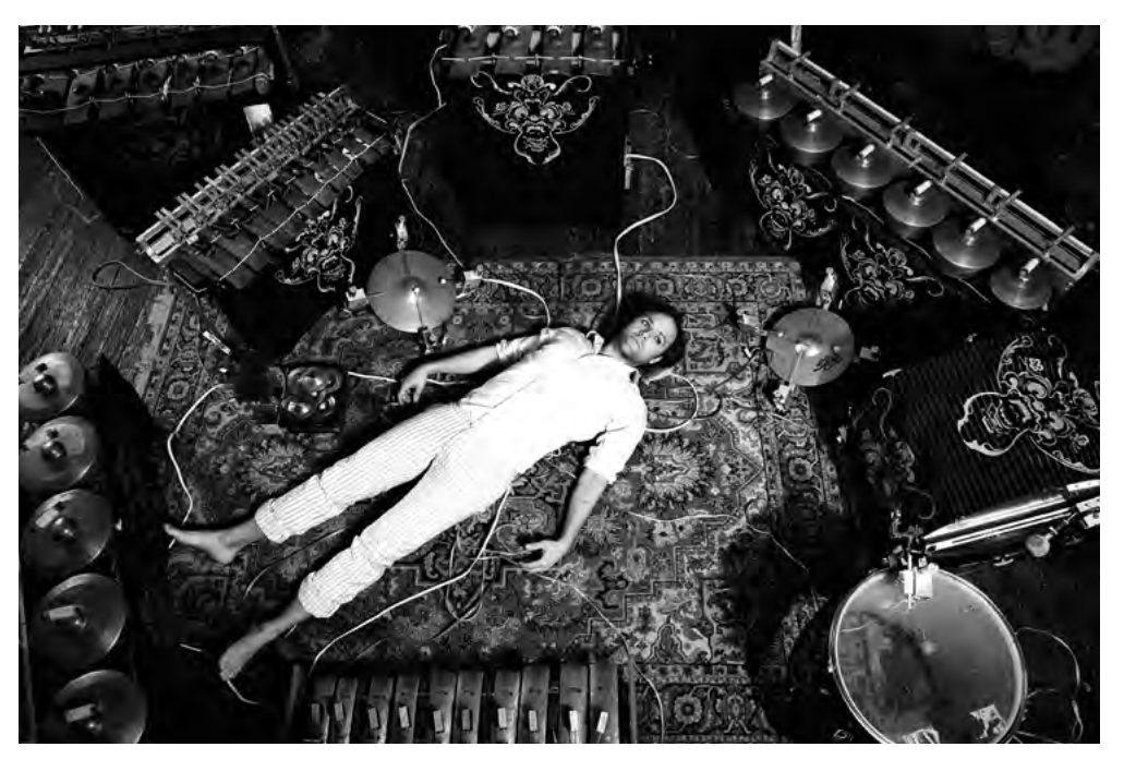
The Gamelatron Project, see page 10