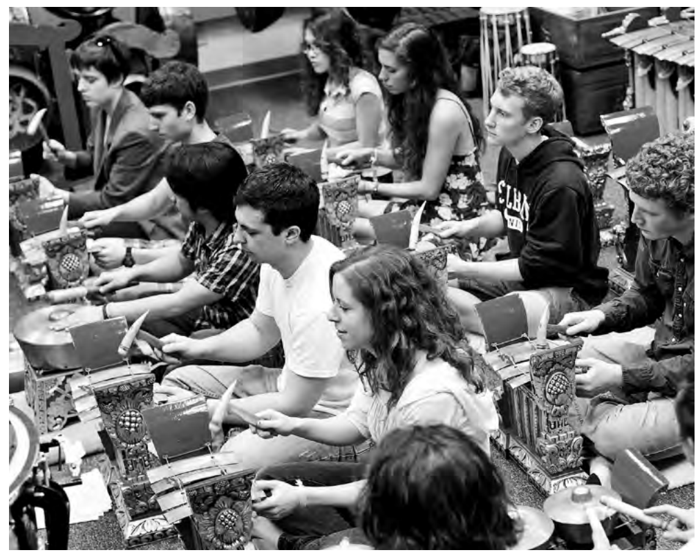
Bucknell Gamelan Ensemble, see page 10