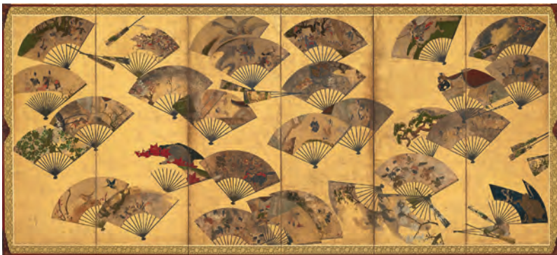
Screen with Scattered Fans “Tatō” seal Tawaraya Sōtatsu (act. ca. 1600–40) Japan, Edo period, early 1600s Six-panel folding screen; color, gold, and silver over gold on paper Gift of Charles Lang Freer Freer Gallery of Art, F1900.24