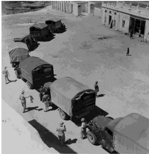
Wendell Phillips' expedition caravan winds its way into the desert; one truck reads "American Foundation Arabian Expedition".