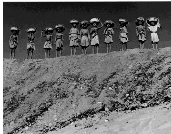
Local Beihani basket boys lined up outside the excavation site.