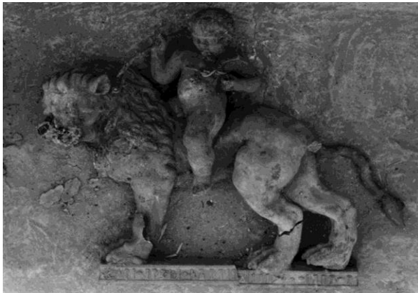
The bronze lions of Timna—one of the pair is shown here during excavation, outside House Yafash at the city's South Gate—indicated that Qataban culture evolved several centuries earlier than previously thought, and played a large role in confirming the chronology of the ancient history of South Arabia.