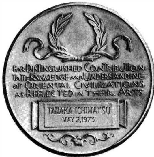
THE CHARLES LANG FREER MEDAL