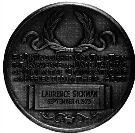
THE CHARLES LANG FREER MEDAL