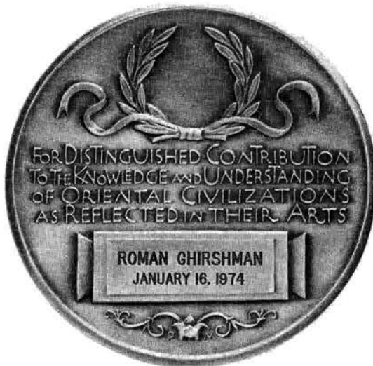
THE CHARLES LANG FREER MEDAL