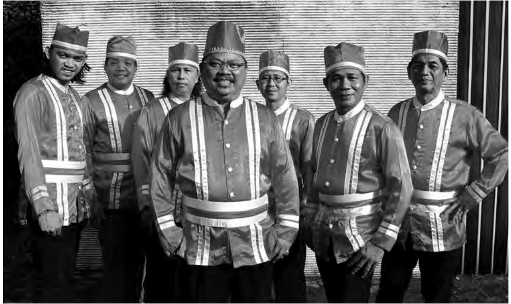
Harmony kolintang ensemble