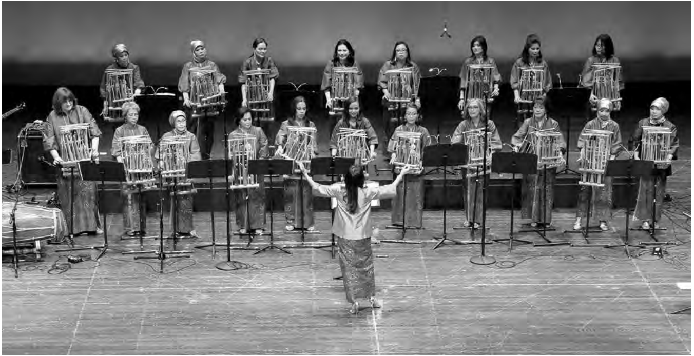
House of Angklung

Indonesian arts, education, and media, and its popularity has spread to other Southeast Asian countries, especially Malaysia, Thailand, and the Philippines. Traditional Sundanese ensembles are tuned to the indigenous five-tone scale known as slendro , with each tube tuned in octaves. Each angklung consists of two to four bamboo tubes that range in size from several inches to five feet tall. These large angklung are characteristic of ensembles found in West Java's mountainous areas. In the villages of Sunda, drums, gongs, metal plates, and sometimes a double-reed ( tarompet ) accompany angklung. Some of the names for traditional angklung music in Sunda are reak , buncis , and ogel . In 2010 UNESCO named angklung music a World Intangible Heritage.