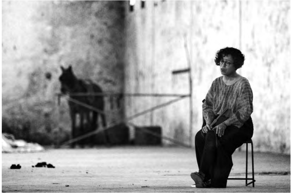
Indonesian vocalist Ubiet