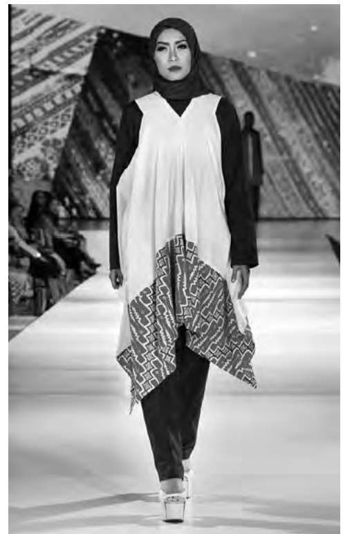
Fashion designs by Meeta Fauzan