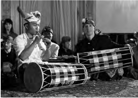
Gamelan Raga Kusuma